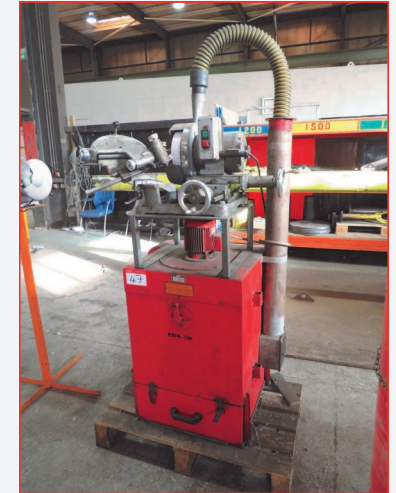
• Dormer Tool & Cutter Grinder

Viewing by Appointment only, please contact our Office on: