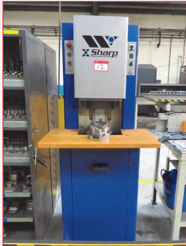
•Wilson X Sharp Punch Tool Grinder (2006)