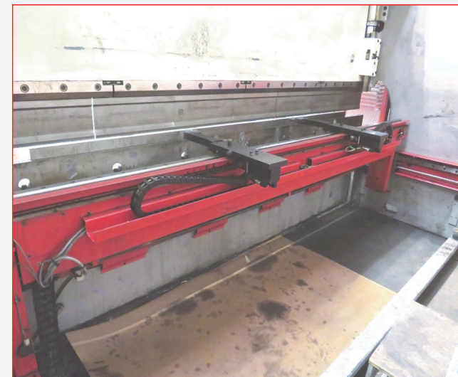
• Edwards Pearson PR6 150 Ton x 4100mm Over Bed CNC Press Brake with Cybelec DNC 880 6 Axis Control, (Y1, Y2, X, Z1, Z2, R) Auto Crowing, Infra-Red Guards, Hydraulic Top Tool Clamping, Side & Rear Safety Fences, Tooling Carousel (1999)