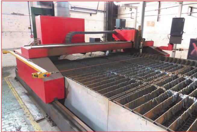
• Esprit Viper 3000 CNC Plasma Cutting Machine, 12m x 3m Table (Can be reduced in 2m long sections) with Hypertherm HPR 260 Power Source, Esprit Edge Pro CNC Control, PC & Software, Power Pierce Technology, Stand Alone Dust Extraction (2007)