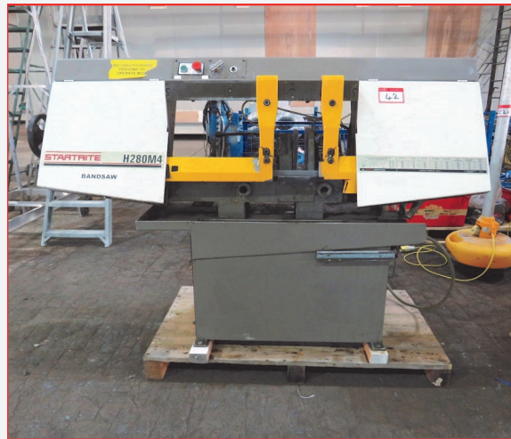
• Startrite H280M4 Horizontal Bandsaw (1999)