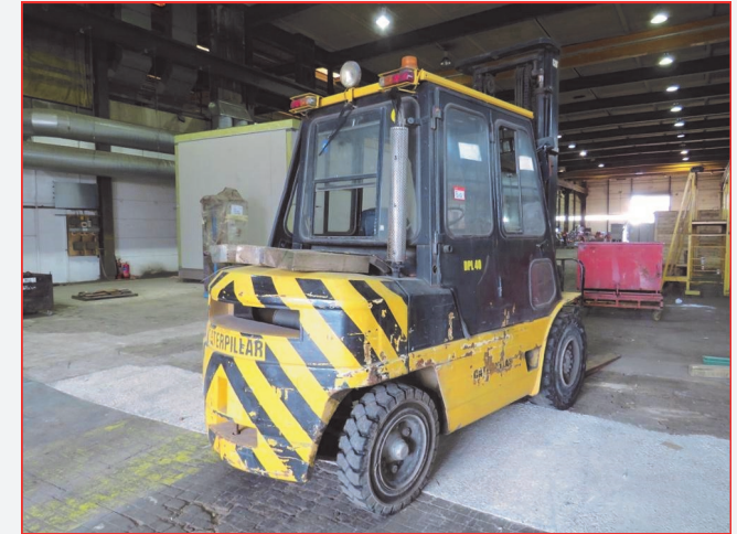
•Caterpillar DPL40 Diesel Fork Lift Truck

Cottrill & Co have considerable international as well as domestic expertise in asset disposals across a diverse range of industries and sectors. Whether you are disposing of an individual asset to a complete facility—