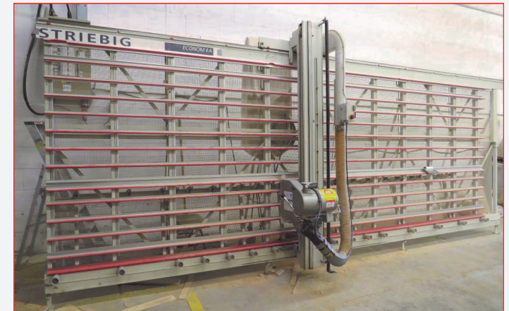
• Striebig Economy 11A Panel Wall Saw, 5600mm x 1800mm High Sheet Capacity, 300mm Blade Diameter, 3Kw Motor, Saw Speed 4750rpm, Integrated Dust Extractor (2003)