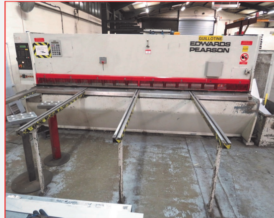
•Edwards Pearson VR 4080mm x 10mm Capacity Hydraulic Variable Rake Guillotine with Cybelelec DNC 10 Control, Auto Blade Gap Adjustment, Heavy Duty Rear Sheet Support System with Integrated Conveyor, (1) x 4000mm Squaring Arm, 3 x 2000mm Sheet Supports, Rear Infra-Red Safety Guarding (1997)