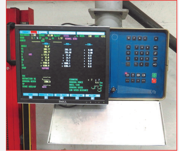
• Edwards Pearson PR10 250 Ton x 5100mm Over Bed CNC Press Brake, Admitting 4500mm Between Side Frames, 3000mm Long Heavy Duty Back Gauge with Cybelec DNC 800 8 Axis Control, Auto Crowing, Infra-Red Operator Guards, Hydraulic Top Tool Clamping, Side & Rear Safety Fences, Tooling Carousel (1997)