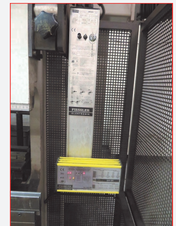
• Bystronic PR 150 Ton x 4100mm Over Bed CNC Press Brake with Cybelec DNC 1200 6 Axis Control, Auto Crowing, Laser Guards, Hydraulic Top Tool Clamping, Side and Rear safety Fences, Tooling Carousel (2004)

For Full Information, Descriptions and Photographs please visit our Website: