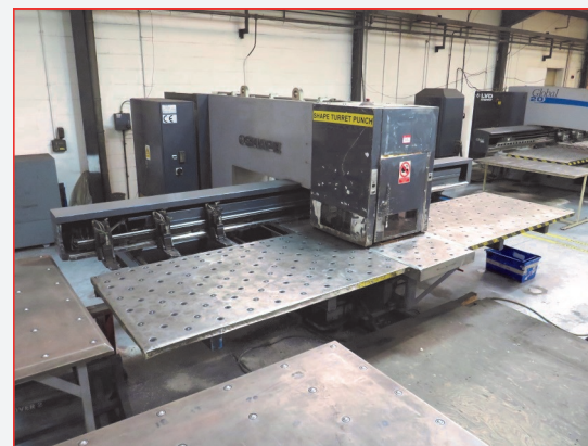
•LVD Delta 1250 Long Beam 20 Ton Capacity CNC Turret Punch with LVD MNC 32000 Control, Punching Area: 1250 x 2500mm or 1250 x 5000mm, Axis Travel: 1275 x 2525mm, 22 Station Thick Turret Configuration with (2) x 88.9mm Auto Index Stations, (3) x Programmable Sheet Clamps (1998)