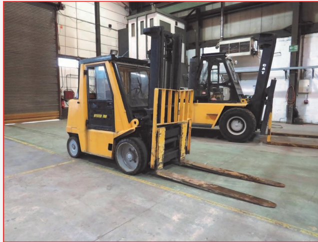
•Hyster 700 Diesel Fork Lift Truck