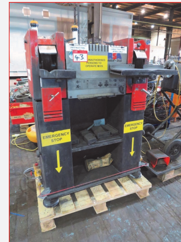
• RSA Rasa Duo Deburrer (2000)