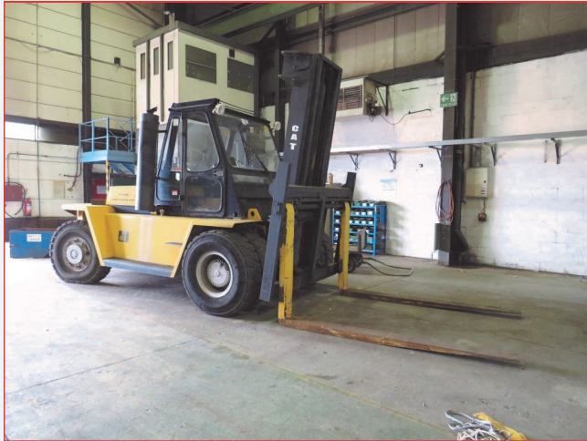
•Caterpillar V300B Type D Diesel Fork Lift Truck