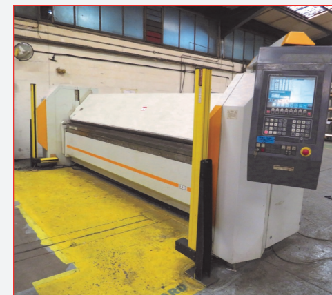
• RAS Type 73.40 Flexibend 4000mm x 2.5mm Capacity High Speed CNC Folder with System 5000 CNC Control System, 'J' Shape Back Gauge with 4000mm Reach, Max Bending Angle 180 deg, Full Length Segmented Goats Foot Top Tooling, (2) x Sets of Segmented Bottom Tools, Infra-Red Operator Guarding (2001)

Viewing by Appointment only, please contact our Office on: