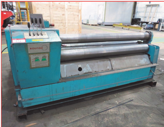
• Roundo PS 135 Hydraulic Double Pinch Plate Bending Rolls, 1550mm long x 135mm Top Roll Diameter, Hydraulic Drop End, All 3 Rolls Driven