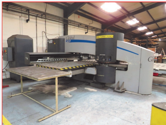
•LVD Strippit Global 20 Ton Capacity CNC Turret Punch with Fanuc 180i-PB Control, Punching Area: 1250mm x 2500mm or 1250mm x 5000mm, Axis Travel: 1275mm x 2525mm, 30-Station Thick Turret Configuration with (3) x 88.9mm Auto Index Stations, (3) x Programmable Sheet Clamps (2001)