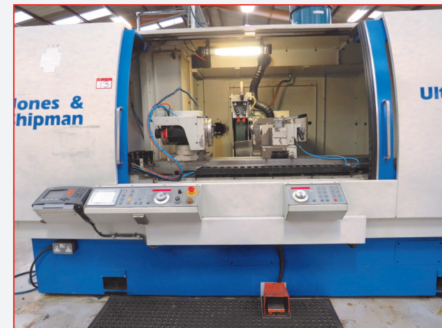
• Jones & Shipman Ultramat U1000 Easy-E CNC Cylindrical Grinder with GE Fanuc Control, Max. Swing: 320mm, Max Diameter Ground: 300mm (2007)