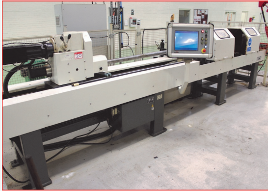
•2-off Sunnen Model HTC 2300W CNC Horizontal Hydraulic Hones (2009/2012)