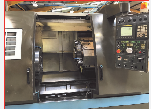
• Doosan 670L 2 Axis CNC Lathe with Fanuc 18i-TB CNC Control, 12 Position Turret, Tool Probing, 2-Point Hydraulic Steady, Swarf Conveyor (2005)