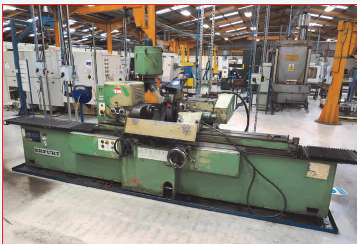
• 2-off WMW Erfurt SU315 x 1500 Plain Cylindrical Grinders with Magnetic Separator, Coolant, Fume Extraction