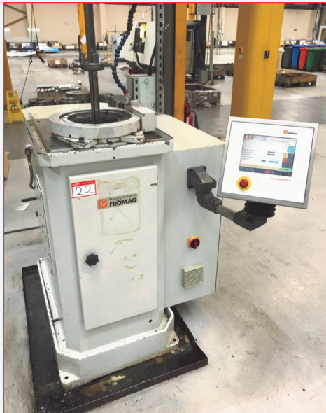
•2-off Fromag CNC E3 2-425PPC Keyseaters (2008/2012)