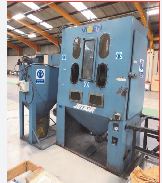
• Vixon VM55SP Jet Air Cyclone Shot Blast Cabinet (2001)

For Full Information, Descriptions and Photographs please visit our Website: