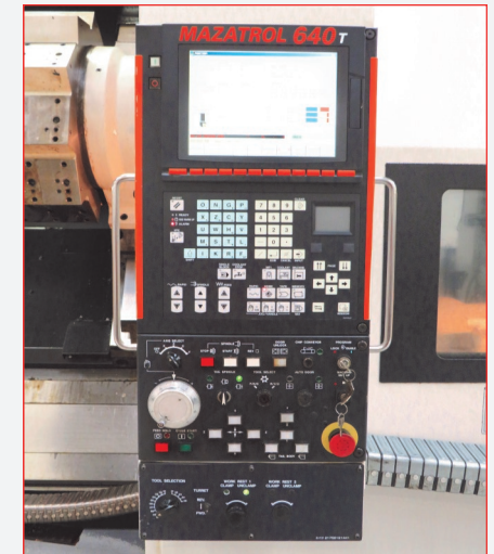
• Mazak Slanturn 50NR CNC Lathe with Mazatrol 640T CNC Control, 10-Position Turret, 2-Point Hydraulic Steady, Programmable Tailstock, 385mm 3-Jaw Hydraulic Chuck, Swarf Conveyor (05/2007)

Viewing by Appointment only, please contact our Office on: