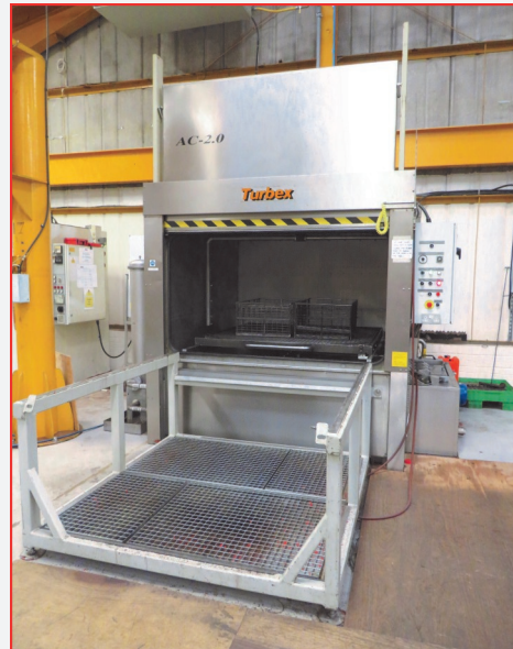
• Turbex AC-2.0LD Heated Parts Washer (2009)