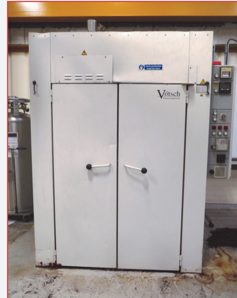
• Votsch Industrietechnik NTL100/150 Electric Oven (1996)