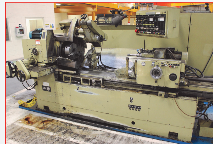
• 3-off WMW Internal Spindle Grinders, Models: S-16-1AS x 710, S16//1ALS-Nx710 & S16/1 AS-N X70

Viewing by Appointment only, please contact our Office on: