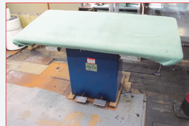
•Ibis & Wilki Steam Press Tables

Viewing by Appointment only, please contact our Office on: