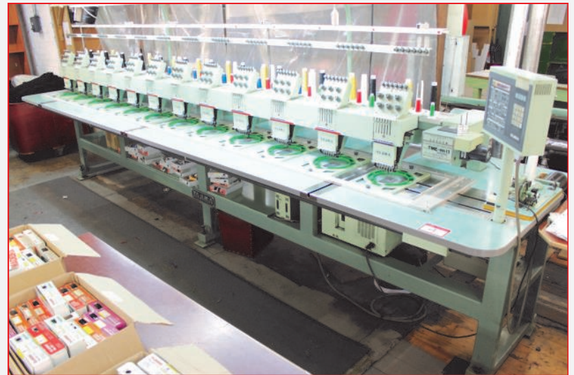
• Tajima TME-H612 Electronic 12 Head, 6 Colour Automatic Embroidery Machine

For Full Information, Descriptions and Photographs please visit our Website: