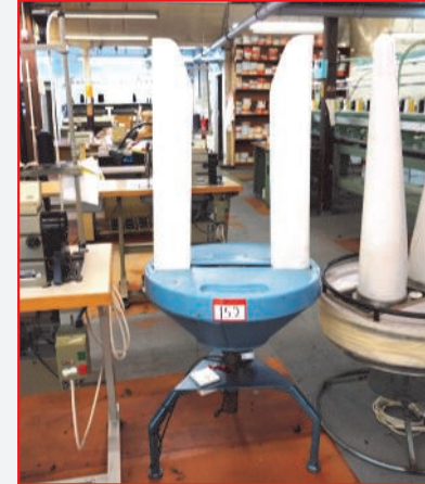
•Qty Rotating Illuminating Product Testers