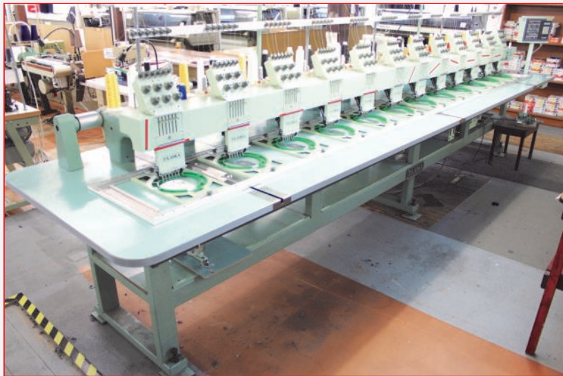
• Tajima TME-H612 Electronic 12 Head, 6 Colour Automatic Embroidery Machine with PC