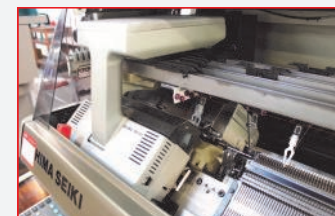
• Shima Seiki SES122CS Computerised 5 Gauge Flatbed Knitting Machine

For Full Information, Descriptions and Photographs please visit our Website: