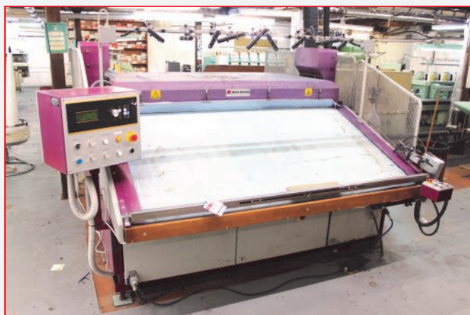
•Monti Antonio 205-2 Programmable Steam Ironing Press (2000)