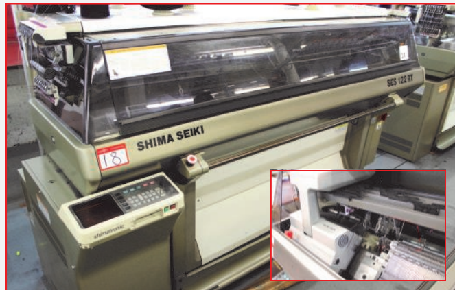
•(21) Shima Seiki SES122RT Computerised 10 Gauge Flatbed Knitting Machines (1995-1997)