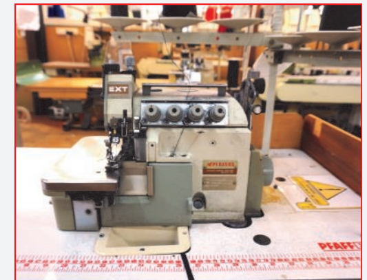
• Qty Pegasus EX Series Overedger Sewing Machines

For Full Information, Descriptions and Photographs please visit our Website: