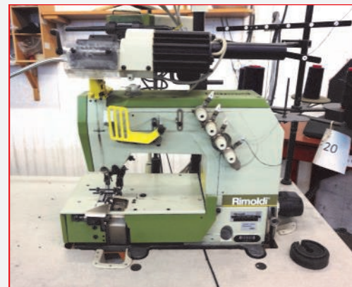
• Qty Rimoldi Sewing Machines