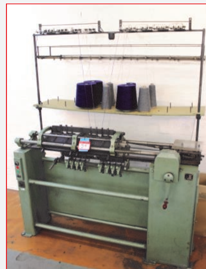
•Robert Steiger S.A. TMA Knitting Machine