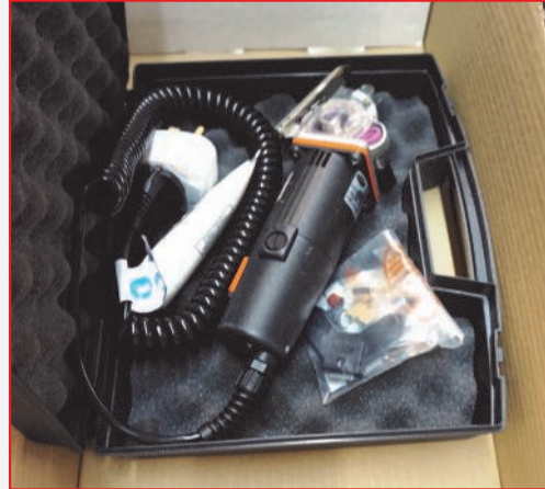
•Qty Razor & Suprena Cloth Cutters