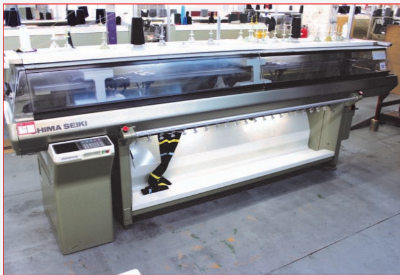
•Shima Seiki SES234FF Computerised 10 Gauge Flatbed Knitting Machine