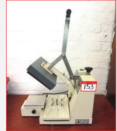
•Qty Heat Presses

Cottrill & Co have considerable international as well as domestic expertise in asset disposals across a diverse range of industries and sectors. Whether you are disposing of an individual asset to a complete facility—