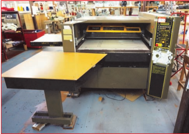
•(2) Bierrebi TA103 Programmable Cloth Cutters