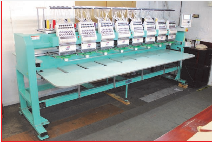
• Tajima 1-3B TFMX-11C1508 Electronic 8 Head, 15 Colour Automatic Embroidery Machine with PC (2011)