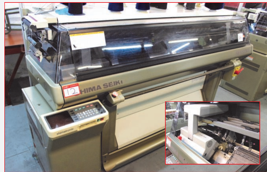
•Shima Seiki SES122FF Computerised 10 Gauge Flatbed Knitting Machine (1993)