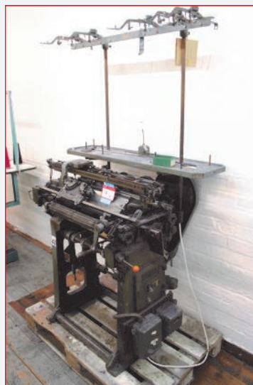
•Stoll Flatbed Knitting Machines