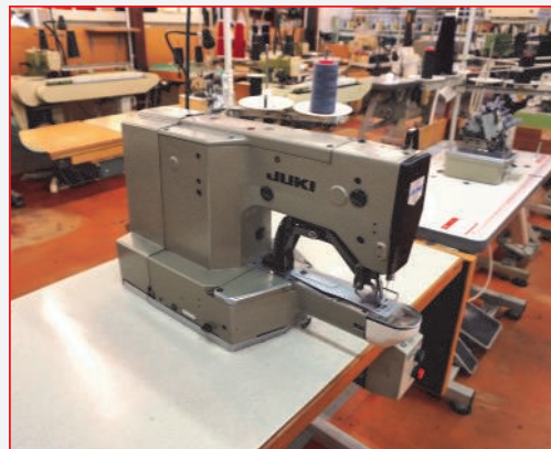
• Qty Mauser Spezial 9652-131M Oval Lock Sewing Machines