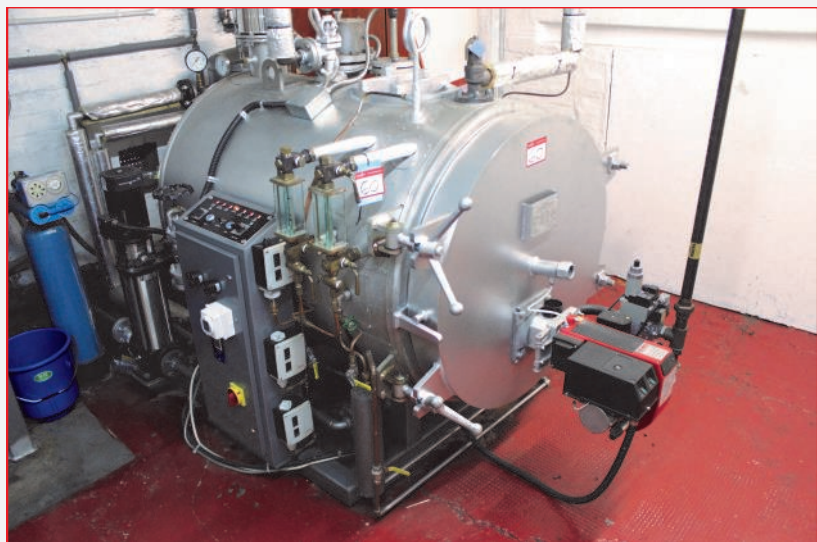
•Byworth MX250-32 Steam Raising Boiler (2012)