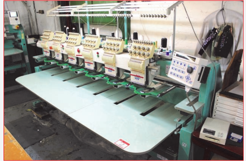
• Tajima 1-1A TMFX11-C906 Electronic 6 Head, 9 Colour Automatic Embroidery Machine