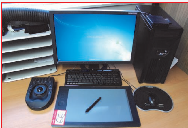
•Shima Seiki Apex 3-2/SDS-061 Design Systems