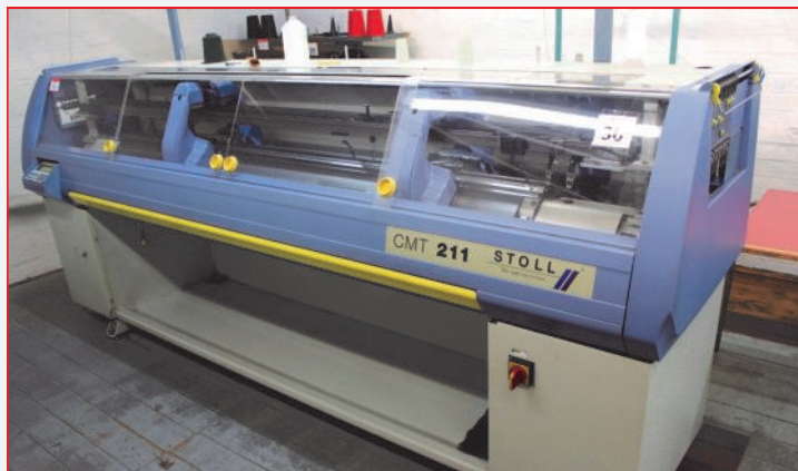
•Stoll CMT 211 450001 Computerised 10 Gauge Flatbed Knitting Machine