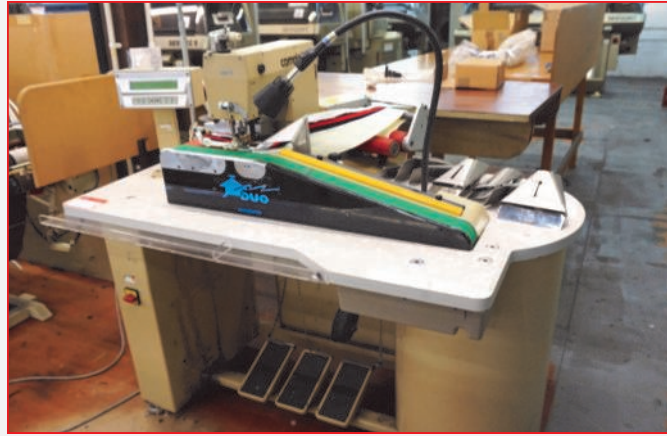
• Complett Duo Sewing Machine