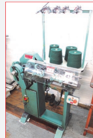
•(3) Scomar S.YUMO & S1-36-21 Ribbing Machines