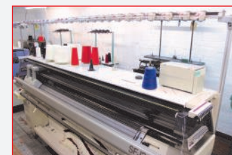
• Shima Seiki SFJ202-T Computerised 7 Gauge Flatbed Knitting Machine