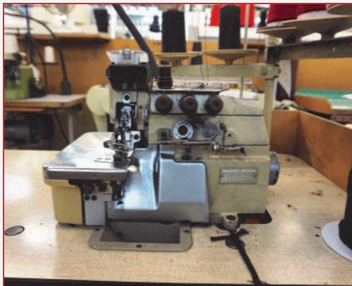
• Juki LL1854 Bartacker Sewing Machine