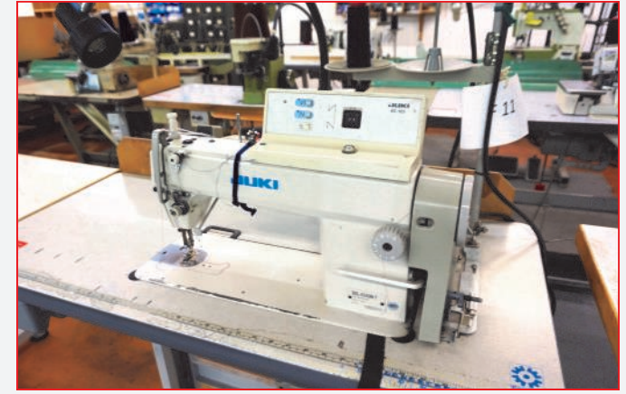
• Qty Juki Lock Stitch Sewing Machines