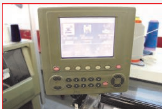
•(4) Shima Seiki SES122-S Computerised 7 Gauge Flatbed Knitting Machines (1995-2003)