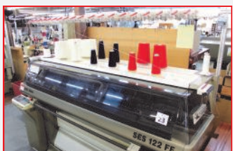
•(4) Shima Seiki SES122FF Computerised 7 Gauge Flatbed Knitting Machines